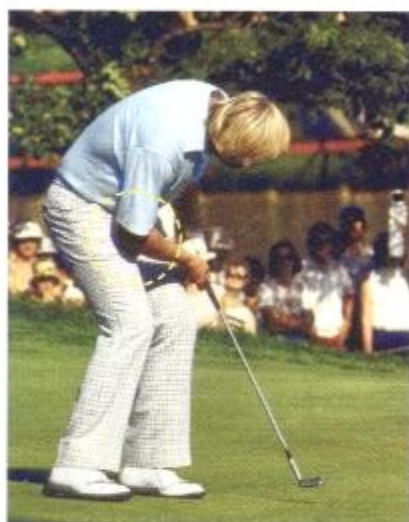
The best thing about Jack Nicklaus's stroke was the way he kept his right elbow in close from start to finish.

"This right elbow position is something I see over and over again in good putting strokes."