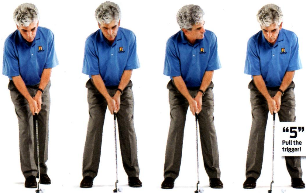
COUNT “1” Step in.

THIS STORY IS FOR YOU IF... 1. YOU GET NERVOUS WHEN YOU PUTT. 2. YOUR STROKE ISN'T SMOOTH.